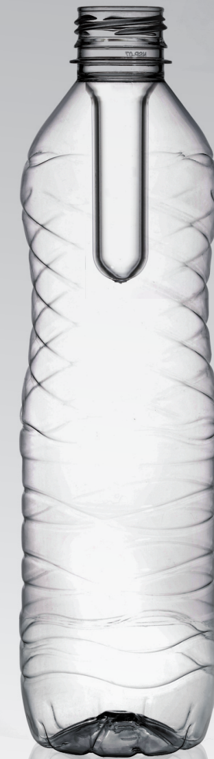
吹瓶机 Blowing Machine